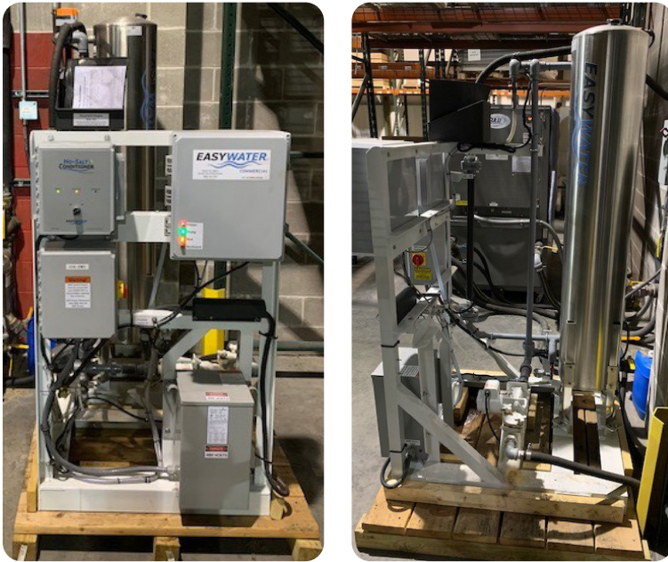
Front and side views of the EasyWater Series C Closed Loop Treatment System at Henniges Automotive