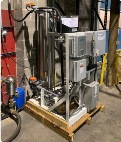
EasyWater Series C Closed Loop Treatment System installed at Henniges Automotive