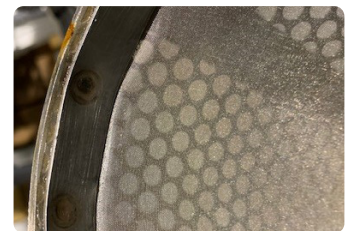
AFTER - One month after adding EasyWater Series C Closed Loop Treatment System