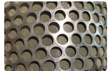
AFTER - Clean prefilter for thermal control unit after one month of EasyWater Series C installation