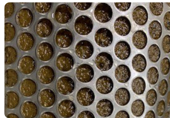
BEFORE - Exterior view of clogged prefilter for thermal control unit

Henniges is so pleased with the results, they installed a second CLC-1000-S for another closed loop at their New Haven facility. They are also obtaining quotations for treating additional closed loops with Series C, as well as cooling towers with EasyWater's CTF System.